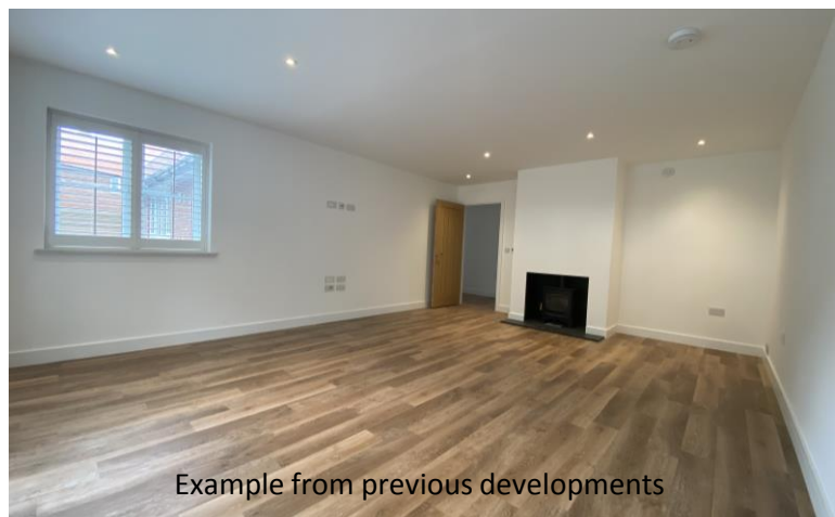
Example from previous developments