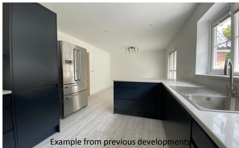
Example from previous developments

This small development of 3 properties enjoys an enviable position in Eye being walking distance to the town centre. The town is steeped in history and provides an interesting range of local shops and a wide array of social and medical facilities. Hartismere High School offers secondary education to sixth form level and is highly regarded, achieving an 'Outstanding' Ofsted rating in November 2014. The town is also well located for access to the A140 just a mile or so away providing a direct route to Norwich and Ipswich, both around 25 miles distant. Just across the county border into Norfolk is the thriving market town of Diss providing local and national shopping, sporting and leisure facilities including an 18 hole golf course and driving range. There is a mainline rail station at Diss providing regular intercity services to Norwich (20 minutes), Ipswich (23 minutes) and London Liverpool Street (around 90 minutes). The renowned Suffolk Heritage Coast around Southwold is within 40 minutes or so by car.