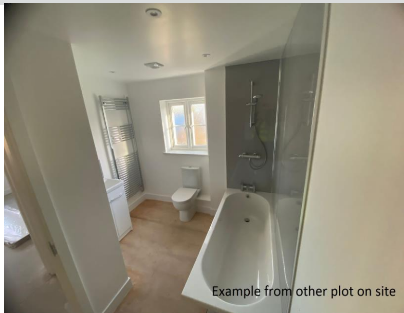
Example from other plot on site