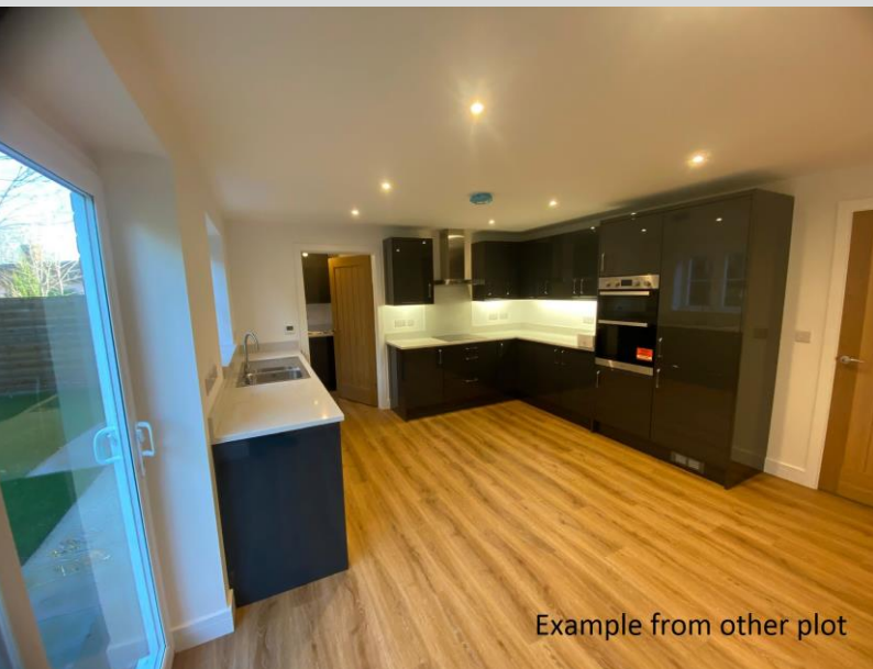
Example from other plot